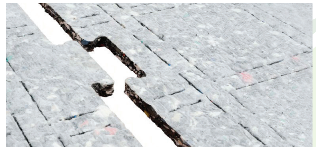
Puzzle shaped ProPlay® sheets with expansion slots.