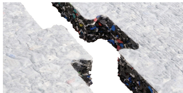
Puzzle shaped ProPlay® for Playgrounds fall protection pad.